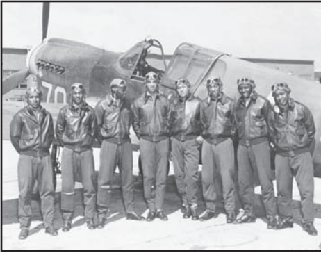
Tuskegee Airmen with a fighter plane