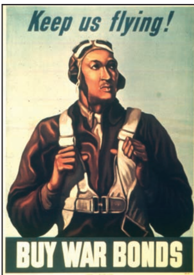
War bond poster showing a Tuskegee Airman

The Tuskegee Airmen were the first African American pilots to fly for the U.S. military. When they were formed in 1941, military rules did not allow white pilots and African American pilots to serve in the same unit. The Tuskegee Airmen were created as a separate unit, which began training at an air field in Tuskegee, Alabama. The Tuskegee Airmen were also known as “Red Tails” because they painted the tails of their planes red.