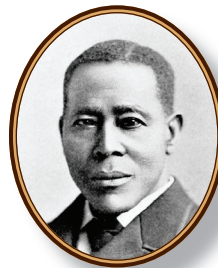
William Still was called the Father of the Underground Railroad.

Station Master: a person who hid escaping slaves in his home.