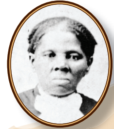
Harriet Tubman, one of the most famous conductors, was known as the "Moses" of the Underground Railroad.